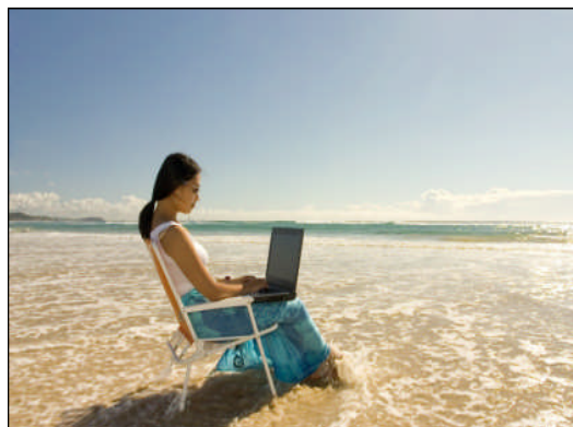
1 out of 4 take their computer on vacation!